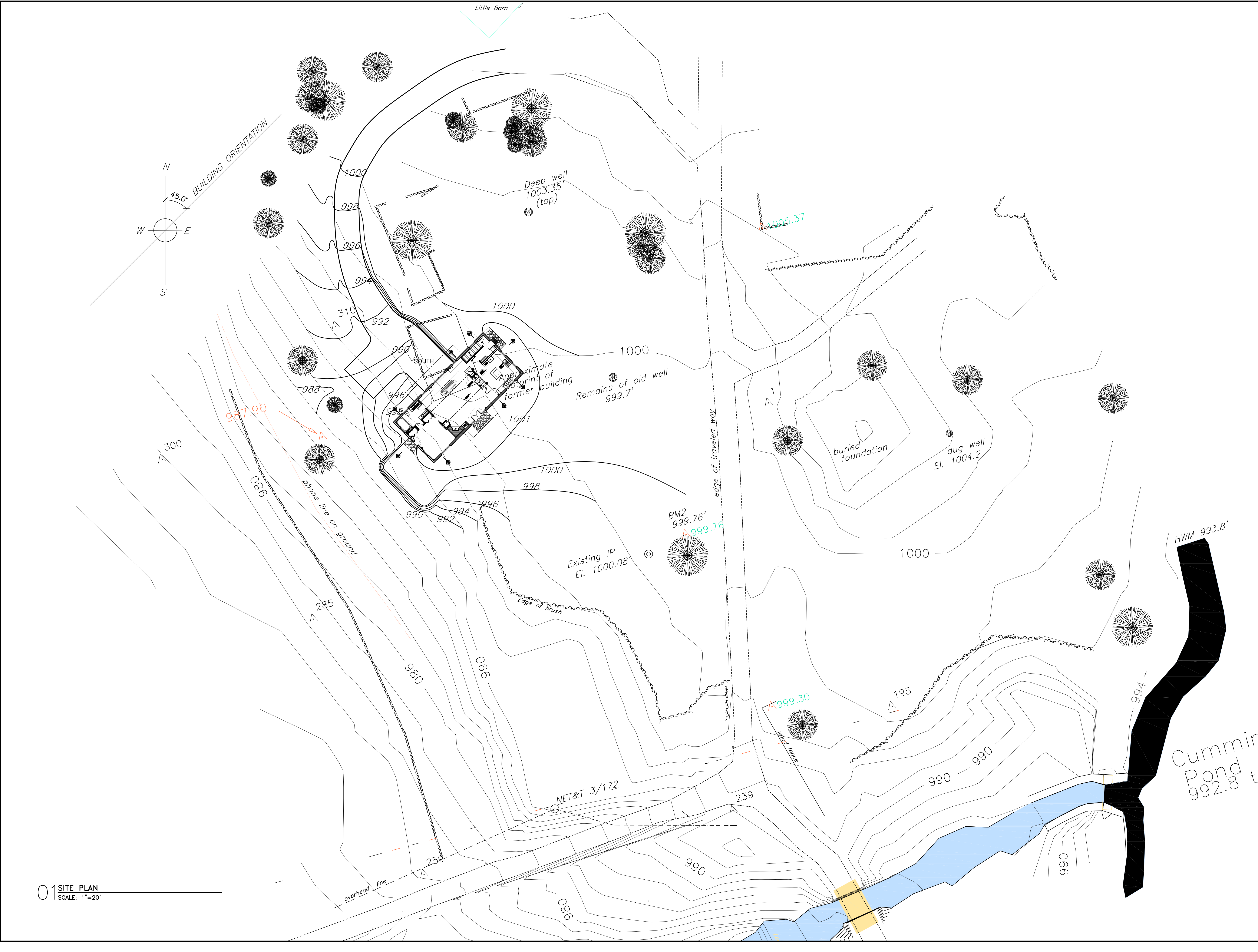
01 SITE PLAN SCALE: 1"=20'